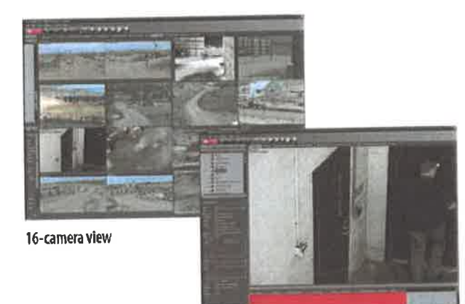
Single camera view

You can rely on the robust, industrial-grade Perkins<sup>®</sup> power plant. Its top-flight engineering ensures dependable, optimized performance. The ultra-quiet, lowspeed diesel engine charges the batteries that provide system power, and an auto-start controller conserves fuel by running the engine only when needed for keeping the batteries fully charged. The system can typically run 30 days or more on a single tank of fuel.